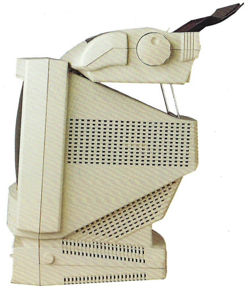
Printer can be clipped to monitor to save desk space.