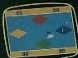
Off Your Rocker™