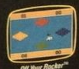
Off Your Rocker™